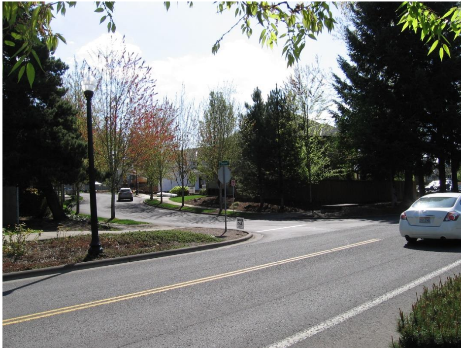
View looking westbound on Meinecke Road at Sequoia Terrace intersection. No apparent sight distance issues for pedestrians crossing Sequoia Terrace.