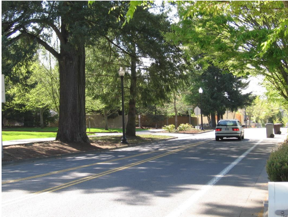
Looking west on Meinecke Road east of church entrance drive. Sequoia Terrace intersection visible in the distance. Proximity of large Douglas Fir trees do present a safety hazard should a car veer off the road. Definitely an immovable object.