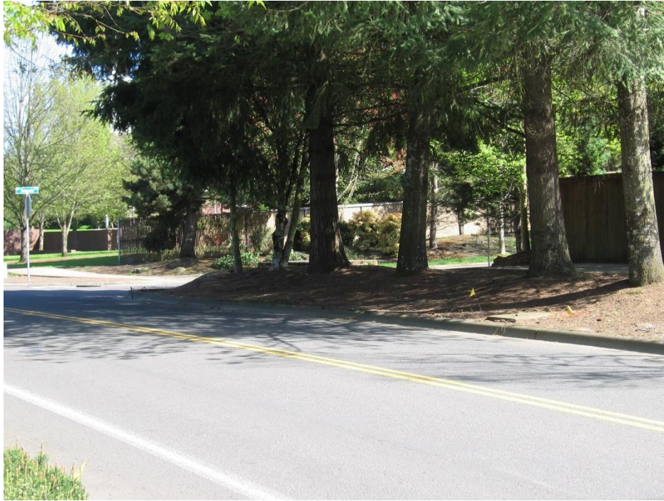
View looking eastbound on Meinecke at intersection with Sequoia Terrace. Note large Douglas Fir trees lining planter strip area between sidewalk and curbline.