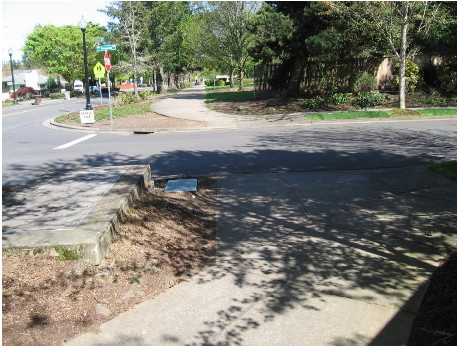
Photo of the actual existing pedestrian crossing conditions. Note that the stop sign and stop bar are located in front of the pedestrian crossing. Essentially, stopped vehicles will stack back into and through the pedestrian crossing. There is no existing pedestrian crossing striping that delineates the crosswalk area. Also, there are no ADA truncated dome tactile inserts in the ramp areas of the crossing. This crossing does not meet current FHWA standards.