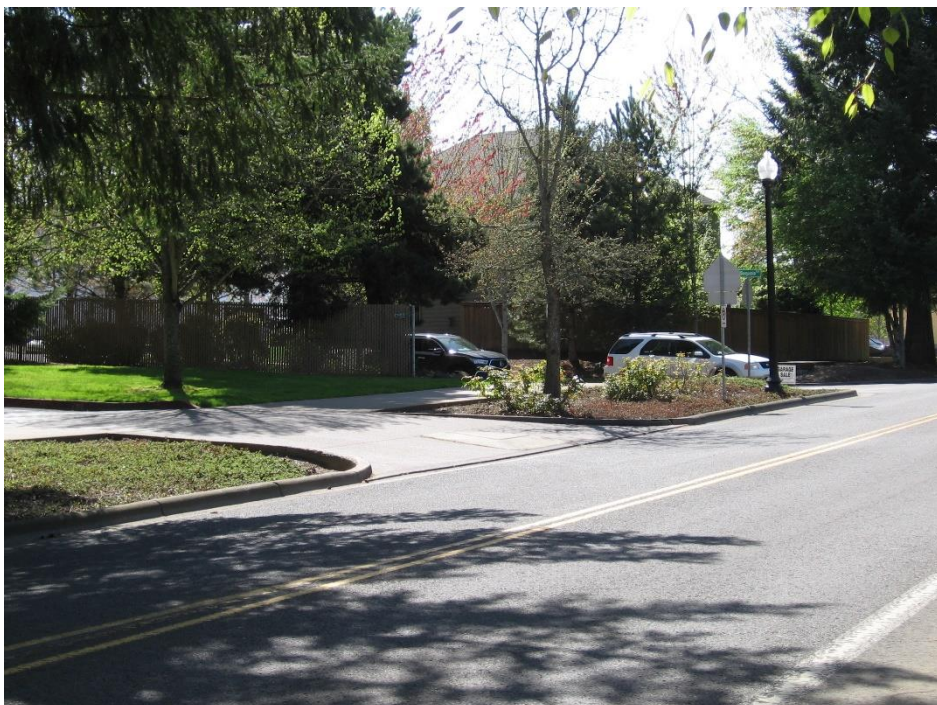
Looking westbound on Meinecke Road at church driveway onto Meinecke. Sequoia Terrace intersection clearly visible. No sight distance obstructions from seeing pedestrians crossing Sequoia Terrace intersection.