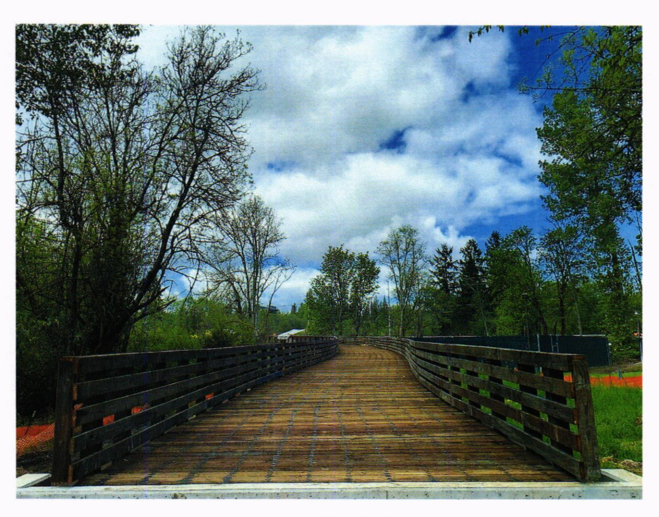
Cedar Creek Trail