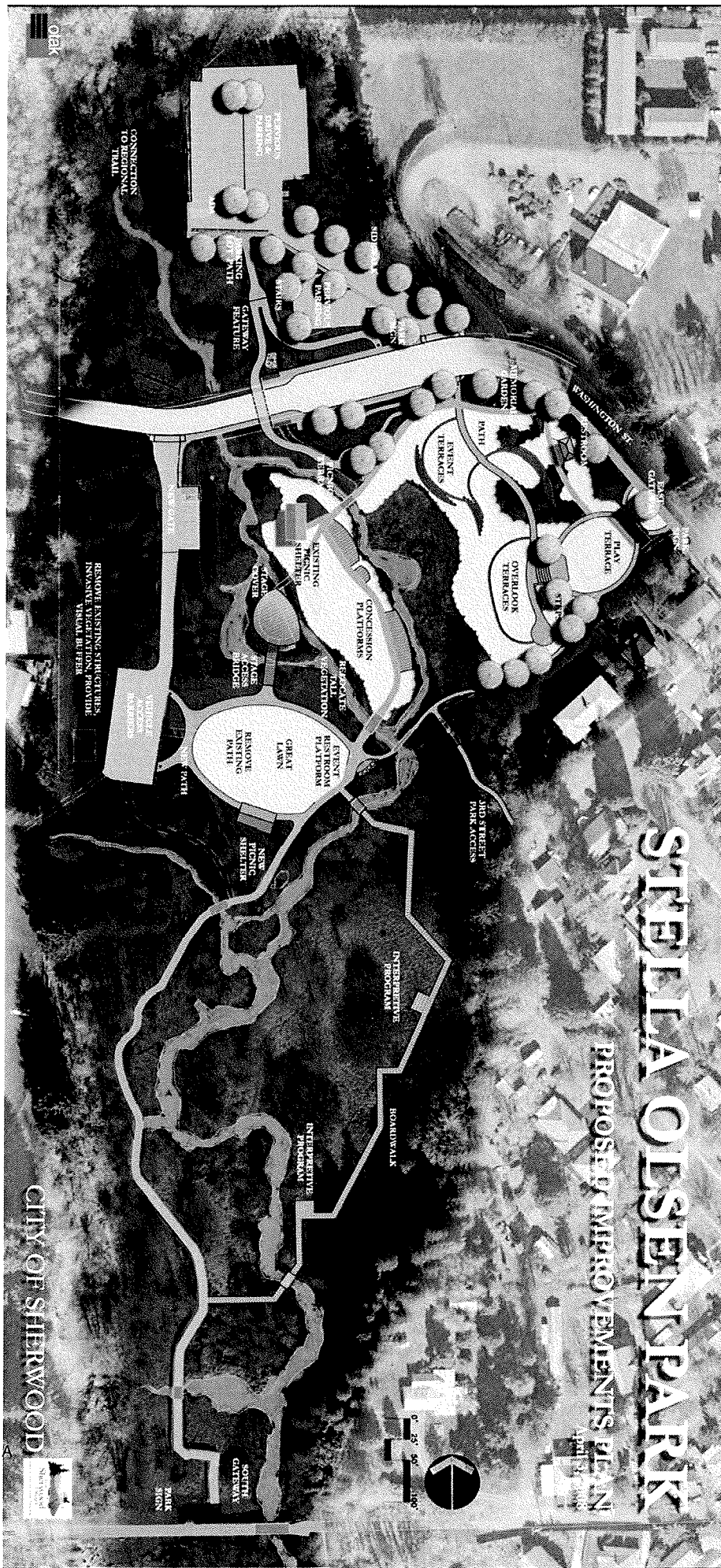
Resolution 2008-035, Exhibit A May 20, 2008