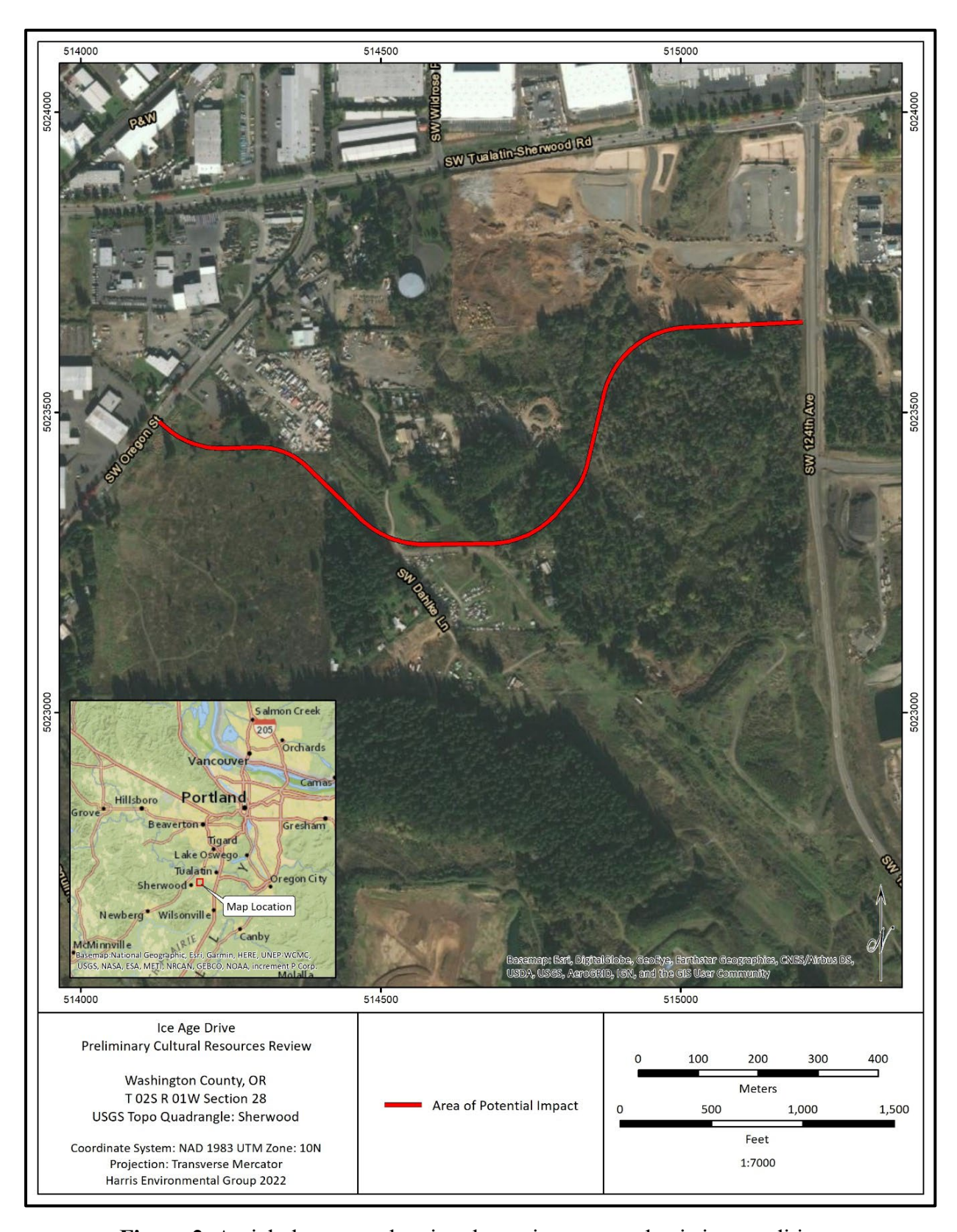
Figure 2. Aerial photomap showing the project area and existing conditions.