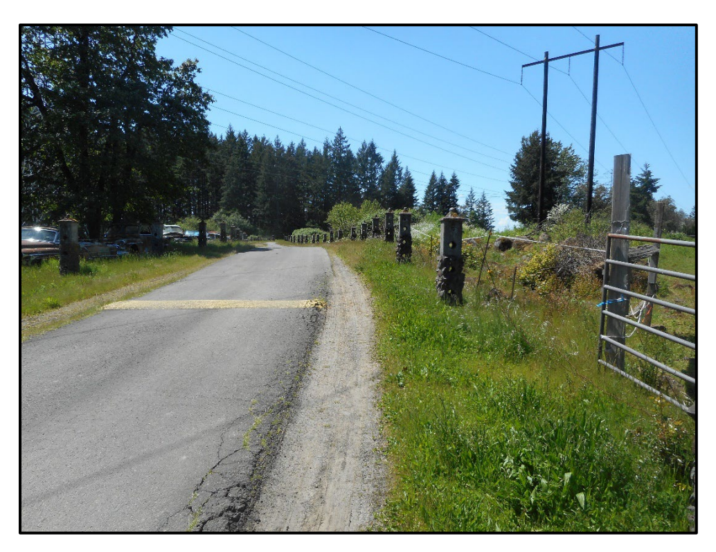
Figure 7. Looking west along the proposed road alignment (SW Dahlke Lane on left).