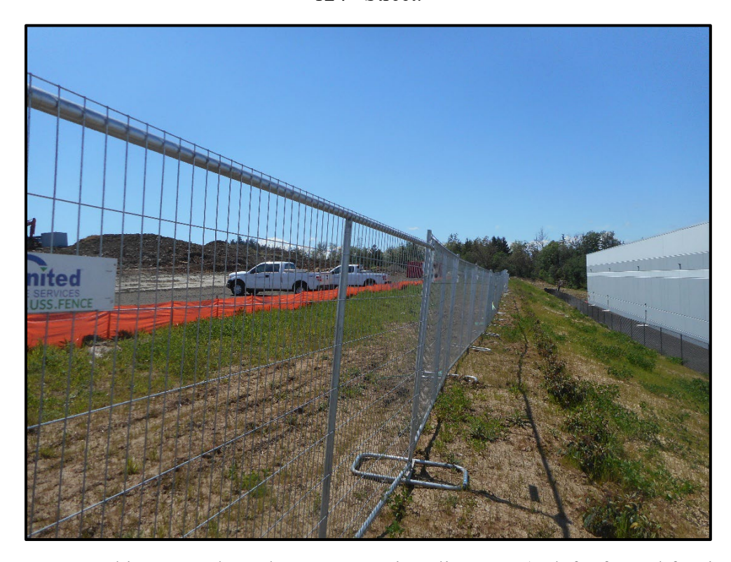
Figure 4. Looking west along the Ice Age Drive alignment (to left of metal fencing).