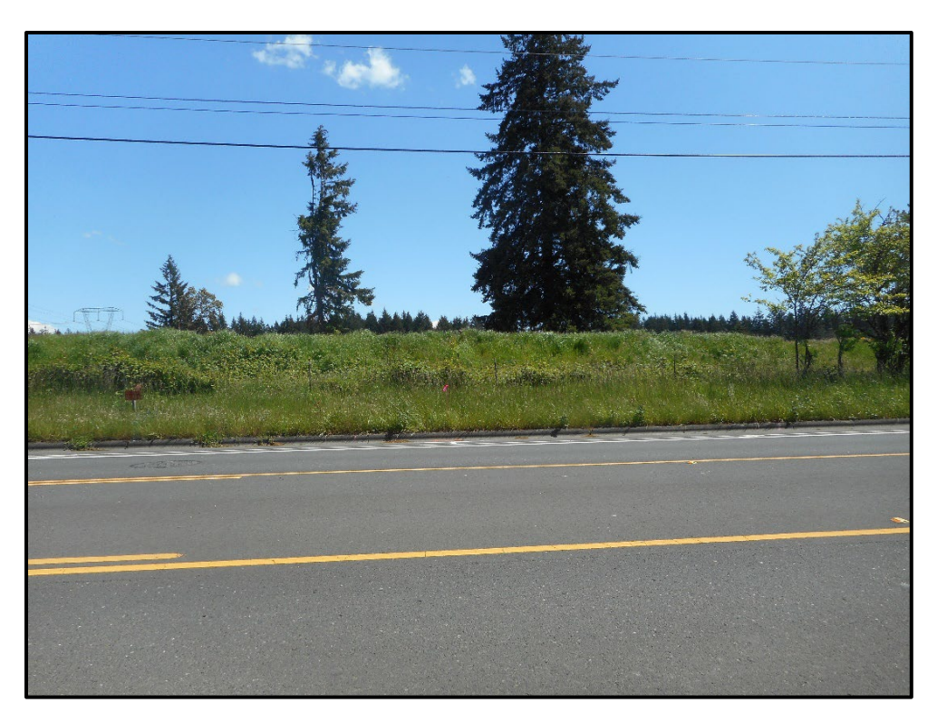
Figure 10. Looking east at western terminus of API, SW Oregon Street in foreground, flag visible where API is located.