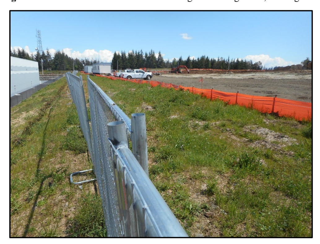
Figure 6. Eastern portion of the Ice Age Drive API, looking east toward SW 124<sup>th</sup> Avenue (in background).