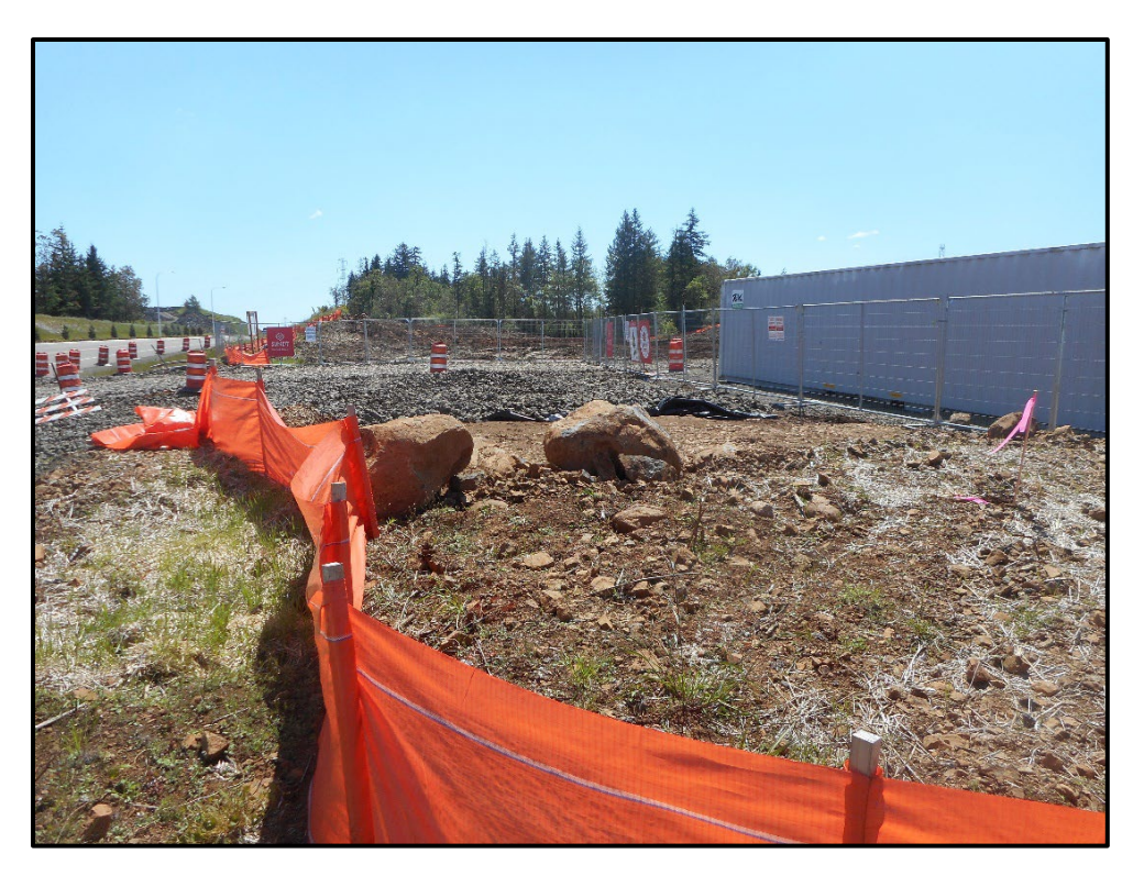
Figure 3. Eastern terminus of the proposed Ice Age Drive alignment, looking south along SW 124^{th} Street.