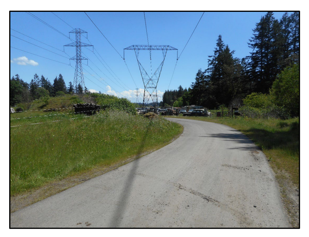
Figure 9. Looking north along the main branch of SW Dahlke Lane, from the point where Ice Age Drive will cross.

No cultural materials or features were observed during limited pedestrian survey conducted during the site visit. Ms. Holschuh noted extensive disturbances in the eastern portion due to development to the north, and on-going construction immediately to the south (Figures 3-6).