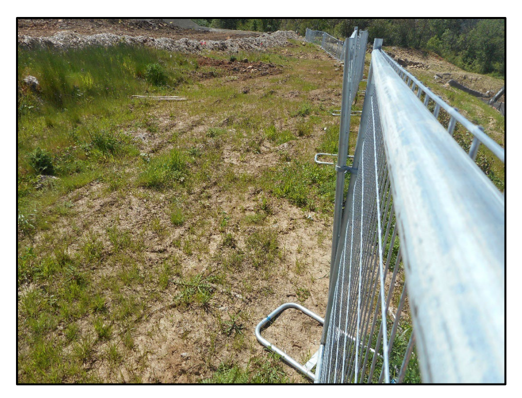
Figure 5. Terrain and soils visible within Ice age Drive alignment, looking east.