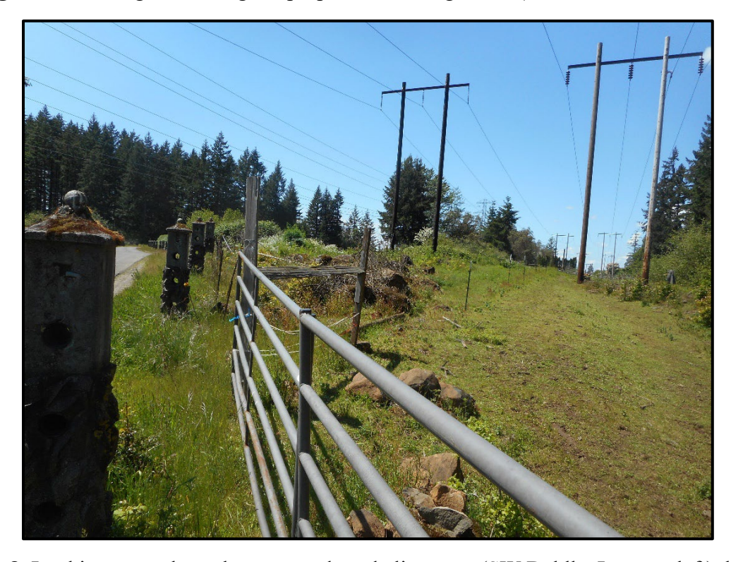
Figure 8. Looking west along the proposed road alignment (SW Dahlke Lane on left), beneath the powerline corridor.