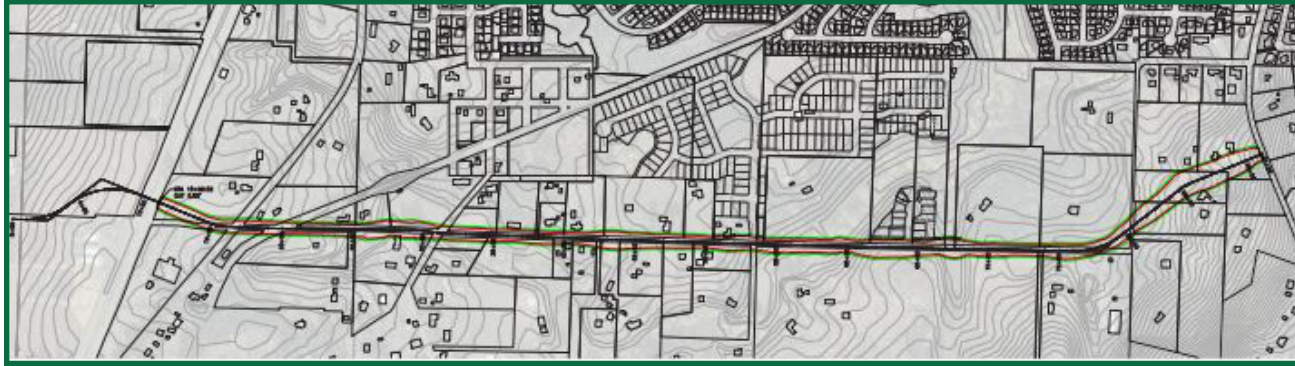
Brookman Road Concept Plan refinement planning recommended alignment of Brookman Road.

In 2009, the Sherwood City Council adopted the Brookman Addition Concept Plan. This plan called for realigning Brookman Road west of Old Highway 99w to create a new intersection approximately 1200 feet north of the current Brookman and Highway 99w intersection. At the time of this plan Brookman was designated as a 3-lane collector. Many factors have changed since the Brookman Concept Plan's adoption, including the new Sherwood High School, Washington County changes to the classification of Brookman Road, annexation requests, and land-use applications for new developments. In a coordinated effort with Washington County, ODOT, and Metro, the City began an effort to analyze the alignment and possible design of Brookman Road. The following goals provided direction during the plan refinement process.