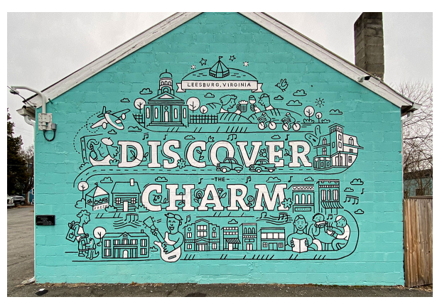
Discover the Charm Mural in Leesburg, Virginia by Sagetophia

Mural idea submissions do not need to address all aspects of a complete mural; the Commission welcomes ideas for designs without a particular location, or locations without a particular design, for example. However, the Commission encourages motivated individuals and organizations to use the following mural proposal process in order to fully develop an idea to include all necessary components (design, location, installation and maintenance plan, etc.) and increase the likelihood of a successful outcome.