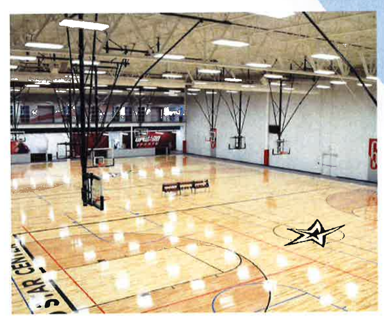
Date of Performance: April 2012- Current

SFA | SFM's Role: In the first scope of work, SFA completed a market analysis and demand analysis, facilitated a round of strategic planning sessions with organizational leaders and key stakeholders, and conducted interviews with existing and potential program directors. Next, SFA outlined the recommended facility program to support the anticipated programming; created construction and start-up cost estimates, and produced a full set of financial and facility utilization projections. Finally, SFA presented the results of the study and projections to the Upward Sports executive team and Board of Directors.