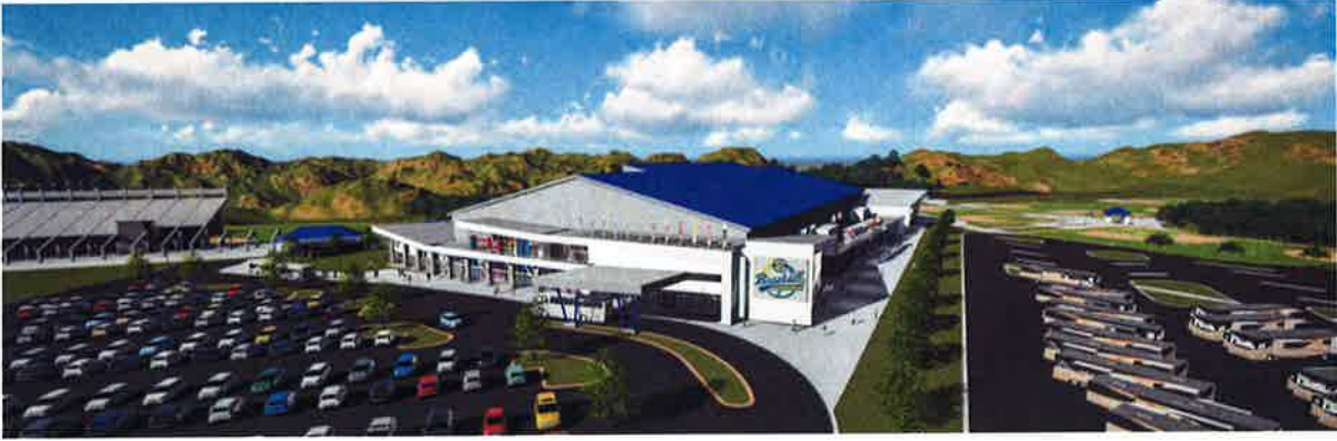
Date of Performance: May 2016- Present

Home of the SEC baseball tournament, this well-established sports venue is growing to include an indoor fieldhouse with multiple court options, outdoor fields, tennis courts, & more. The project also includes an RV park, splash pad, 10,800 person stadium, and a pro shop.