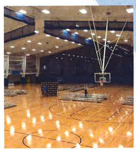
Date of Performance: March 2013- Currently Full-time Managed

SFA | SFM's Role: The initial market analysis and community needs/demand assessment phase included SFA's typical process of strategic planning, key stakeholder and user group interviews, and involved discussions with key decision-makers related to the program/activity plan (facilities, parking, sports surfaces, lighting, concessions, and other specifics), the financing structure, the operating and management model, main and ancillary revenue-generating programs, and site analysis.