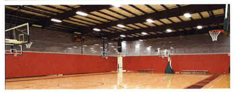
Date of Performance: October 2010 - Current Full-Time Management

Legends Sports Complex is a 100,000 square-foot indoor and outdoor multi-sport facility featuring batting cages, a rock wall, fitness center, sand volleyball courts, basketball/volleyball courts, turf fields and more.