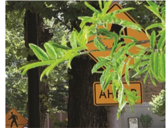
Sign blocked by vegetation

This includes behind the property line and the area on the street side of the property line within the public right-of-way.