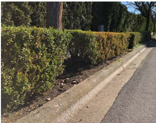
Shrub trimmed behind the curb line

These guidelines allow street sweepers to do a thorough job and prevent damage to vehicles when parking. These practices also aid in reducing unwanted materials from being washed down storm drains, which may plug lines and pollute our rivers.