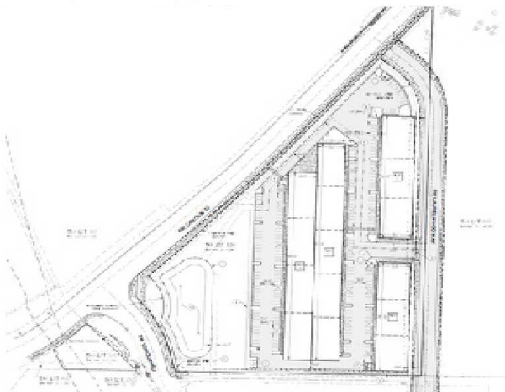
Oregon Street Business Park located along SW Tonquin and SW Oregon Street.

The Sherwood Planning Commission approved the Oregon Street Business Park site. The site will consist of four separate industrial buildings for a total of 115,170 square feet for employment uses.