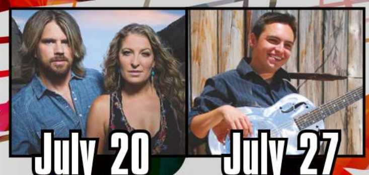
July 20 Cloverdayle COUNTRY/ROCK July 27 Ben Rice RHYTHM AND BLUES