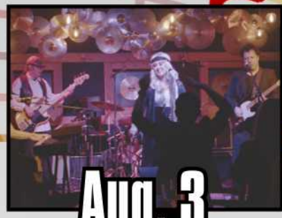
Aug. 3 Taken By The Sky FLEETWOOD MAC/TRIBUTE BAND