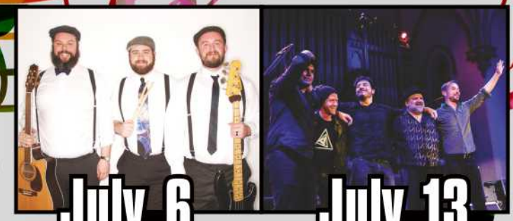
July 6 The Junebugs FOLK/ROCK/AMERICANA July 13 Mbrascatu WORLD INDIE ROCK