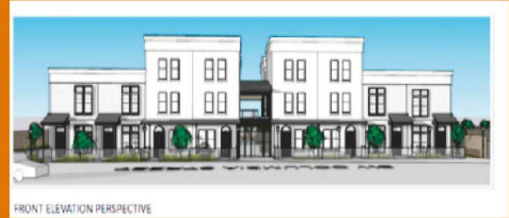
FRONT ELEVATION PERSPECTIVE

The Sherwood Planning Commission held a public hearing on March 8, 2022, to review the application and hear public testimony. After taking public testimony that included issues raised about site drainage, grading, and vehicle parking to 26 spaces, the Commission deliberated and approved the project. For more information about this project, please visit: www.sherwoodoregon.gov/planning/project/lu-2021-022-sp-var-la-mlp-old-town-apartments .